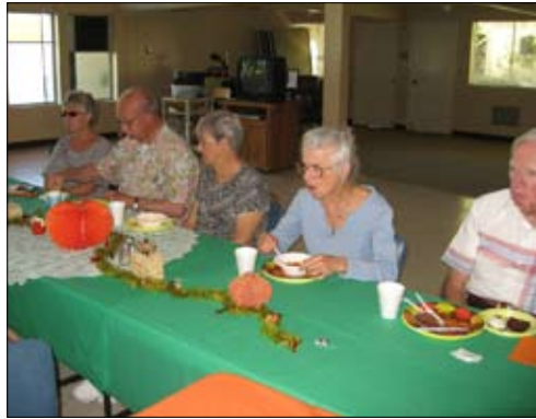
Prime Timers at the porluck in November